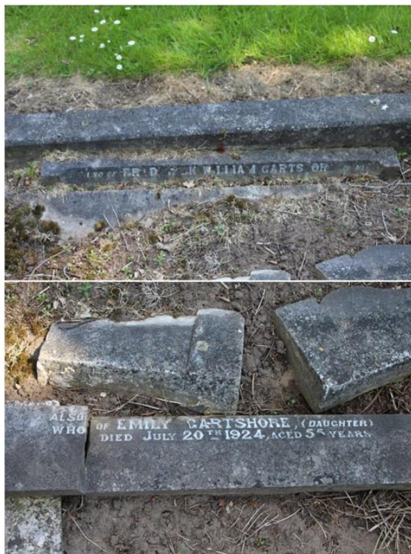
Gartshore Grave F78